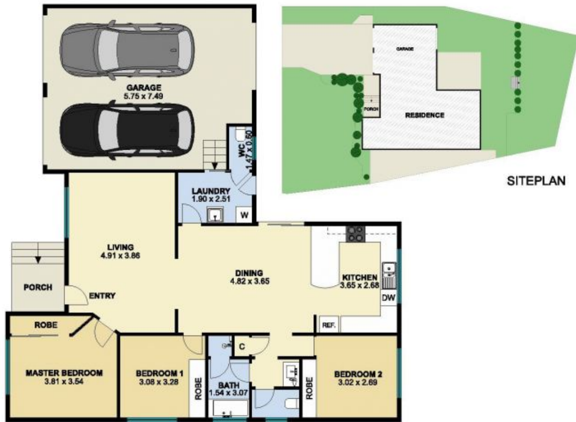
38 Downes Crescent, Currans Hill

The site plan and floor plan are not to scale; measurements are indicative and in metres. Boundaries and lines are placed for illustration purposes. Plans should not be relied on. Interested parties should make and rely on their own enquiries.