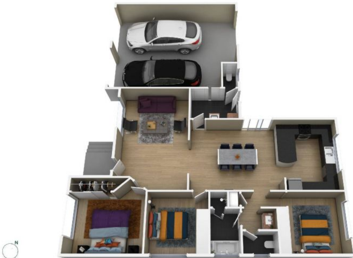
38 Downes Crescent, Currans Hill

The floor plan is not to scale; measurements are indicative and in metres. All features included in this 3D plan are for illustrative purposes only. This is not an exact replica of the property or the position of exterior elements. Plans should not be relied on. Interested parties should make and rely on their own enquiries.